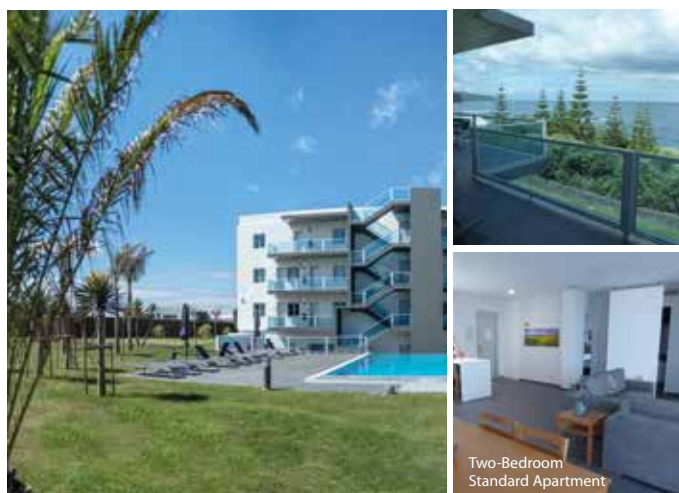
Two-Bedroom Standard Apartment